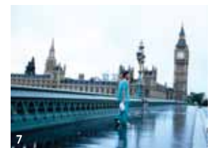
Image credits: 1. MADE IN DAGENHAM courtesy of Paramount Pictures, 2. FANTASTIC MR FOX courtesy of Fox Animation, 3. NEVER LET ME GO courtesy of Twentieth Century Fox, 4. EASTERN PROMISES courtesy of Focus Features, 5. SUNSHINE courtesy of Twentieth Century Fox, 6. FISH TANK courtesy of Artificial Eye Film Company, 7. 28 DAYS LATER courtesy of Fox Searchlight. All rights reserved